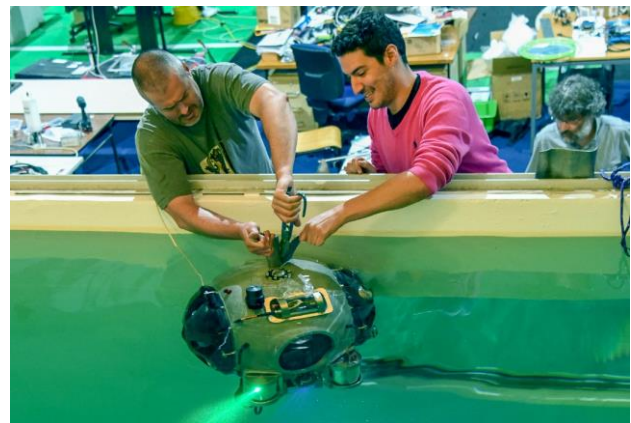
Figures: Left -Scientific instruments assembly; Right – UX-1 prototype testing

The next steps on the project development will involve the first tests in a real environment. The UX-1 prototype will be tested in the Kaatiala pegmatite mine, an open-pit mine with a small underground part, where the robot's main functionalities – movement, control, propulsion, navigation, 3D mapping, data acquisition, and, most importantly, autonomy – will be tested, monitored and improved with a joint effort from the UNEXMIN team. The Kaatiala tests will run from the 11 th to the 22 nd of June.